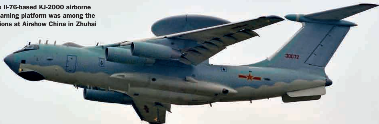
China's Il-76-based KJ-2000 airborne early warning platform was among the attractions at Airshow China in Zhuhai