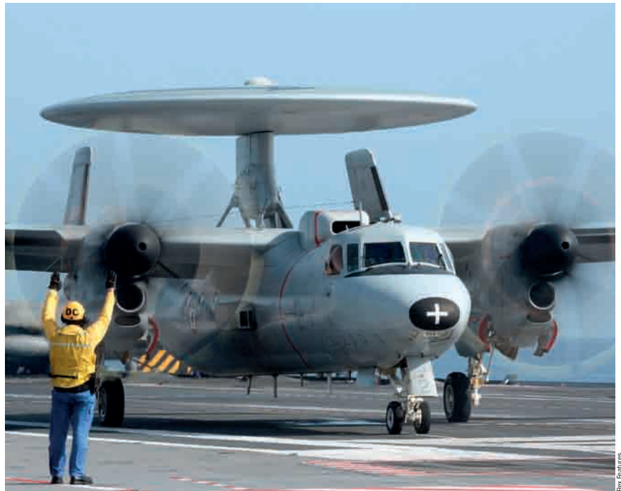
E-2C Hawkeyes are deployed aboard the French navy aircraft carrier Charles de Gaulle