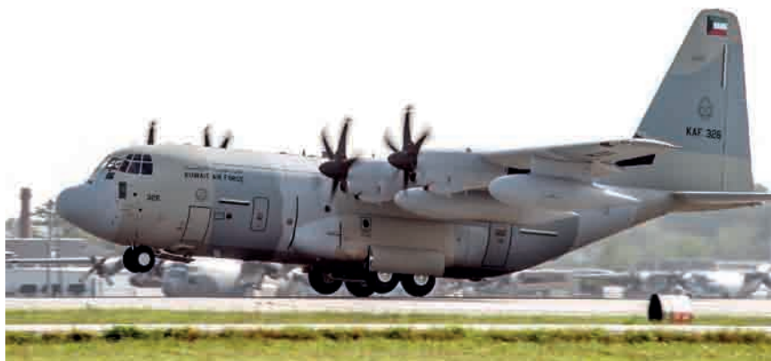
Kuwait has an option to add to its trio of newly-delivered KC-130J tankers