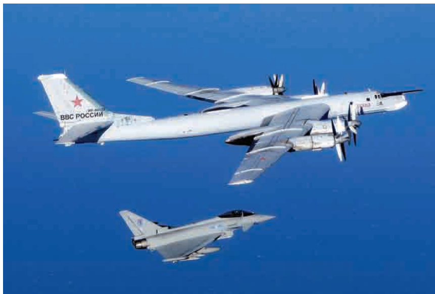
Russia's activities with its Tu-95 bombers have tested the response of NATO allies

Despite lingering flight envelope restrictions imposed following an engine fire which badly damaged an A-model aircraft on the ground earlier in the year, the F-35 programme received a subsequent boost, with the confirmation of a $4.7 billion, eighth low-rate initial production deal to produce 43 of the aircraft; with a related engine package yet to be finalised. The USA succeeded in getting orders from three of its partner nations – Italy, Norway and the UK – as part of the contract, plus from export customers Israel and Japan.